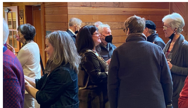
2022 Red Cedar Council Luncheon at Heyday Farm