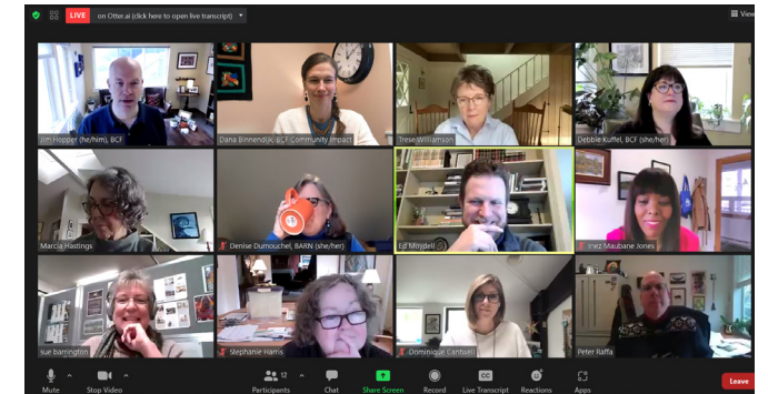
2022 Arts, Culture, and Humanities Sector Gathering

Other issues discussed at the sector gatherings included livable wages for nonprofit employees and recruiting more volunteers. We look forward to consolidating the analysis